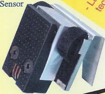
Brake Pedal Sensor