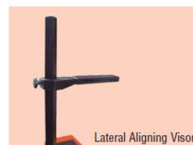
Lateral Aligning Visor